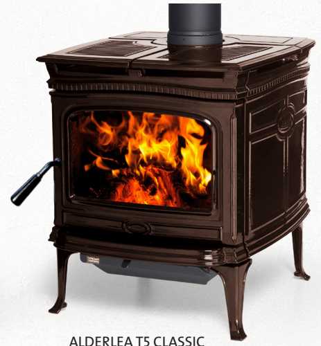
ALDERLEA T5 CLASSIC

For reference only. Installations should be based on installation manuals. Specifications subject to change.